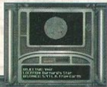
Planet and Mission Briefing

Warning: All information may not be listed. There will be surprises along the way.